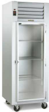
Model RHT126WPUT-FHG (shown with optional casters)