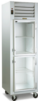
Model RHT132DUT-HHG (shown with optional interior arrangements & casters)