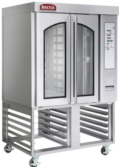
Shown with optional 12 pan stand