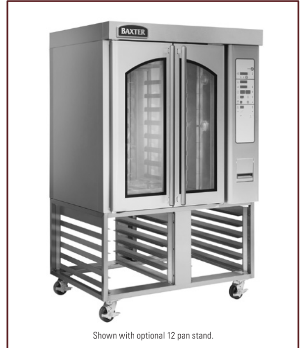
Shown with optional 12 pan stand.

Note: Capacities based on a standard 18"x26" pan