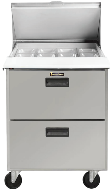
27" WIDE MODEL CLPT-2708-DW