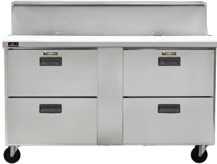
60" WIDE MODEL CLPT-6016-DW