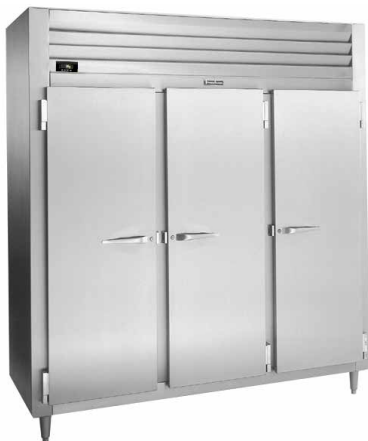
Model Shown Three Section