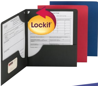
Lockit® Two-Pocket Folders