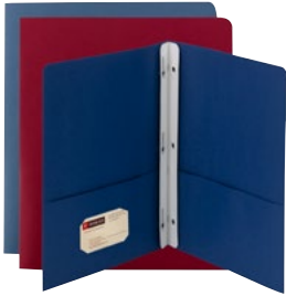
Two-Pocket Folders with Fasteners