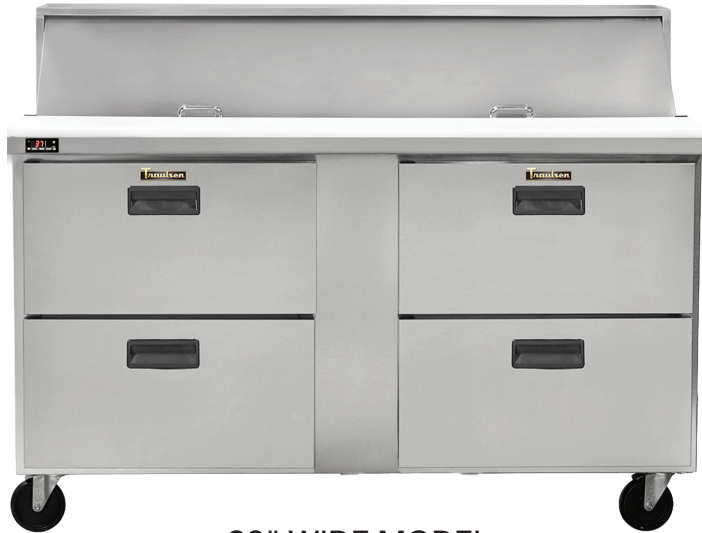
60" WIDE MODEL CLPT-6024-DW