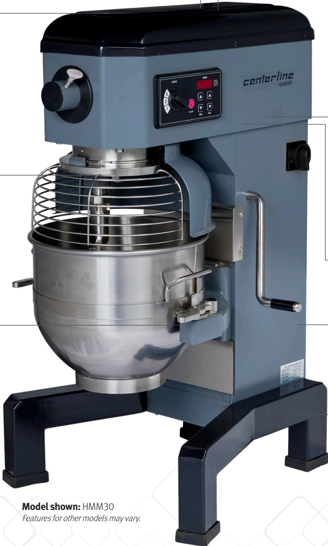
Model shown: HMM30 Features for other models may vary.

Smooth edges and minimal areas where debris can accumulate.