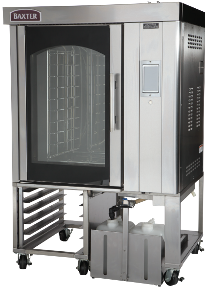
Overall Dimensions: 48"W x 38"D x 75"H