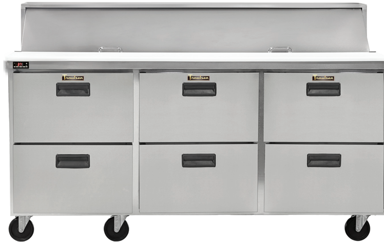
72" WIDE MODEL CLPT-7220-DW