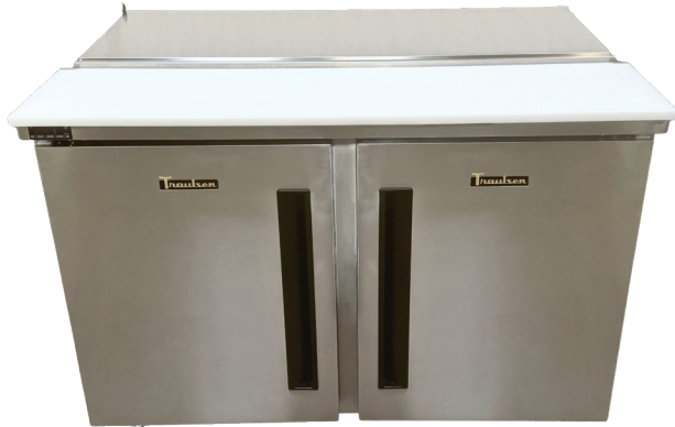
Representative, 48" wide model shown