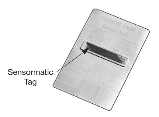
Rear or Sticky Side of Label