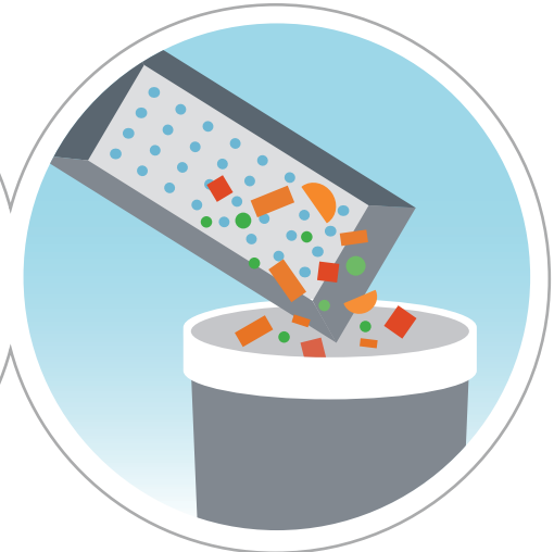
External scrap basket allows easy waste removal between washes.