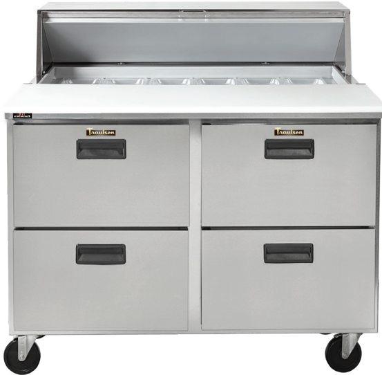
48" WIDE MODELS CLPT-4818-DW