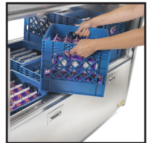
Sliding Door Protects Gaskets