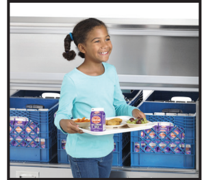
Lowest self-serve access point

Traulsen knows you need long lasting, high quality equipment that's easy to maintain and less expensive to operate – and we deliver just that with the RMC Milk Cooler series. With our top-mounted, forced air system, Traulsen achieves superior temperature maintenance, ensuring consistent, safe temperatures throughout the cabinet. To withstand the daily stress of loading full milk crates, the bottom of every, all-stainless steel unit is reinforced with heavy duty dunnage racks, plus caster channels for flexibility of installation and even more durability. Finally, you will find the RMC-Series Milk Cooler offers the lowest self-serve access point in the industry, making it easy for the smallest of customers to get what they need.