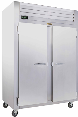
Model Shown Two Section (shown with optional casters)