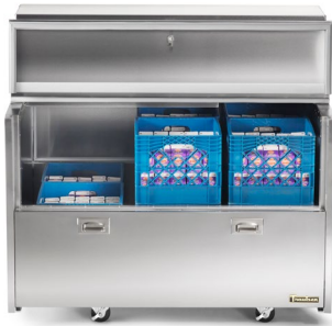
Model RMC 49D4 (12 Crate 49" Length)