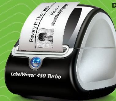
DYMO® Item #DYM1752265

The DYMO® LabelWriter® 450 Turbo rapidly handles all of your labeling and filing needs and nimbly prints postage. Printing 4-line address labels at an impressive 71 labels per minute, the DYMO® LabelWriter® 450 Turbo label and postage printer saves you serious time.