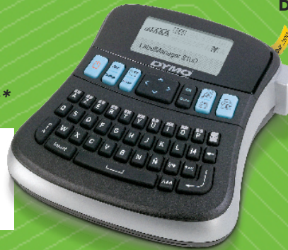
DYMO® Item #DYM1738345

DYMO® LabelManager® 210D prints durable, water-resistant labels making it easy to access files, charts, tools and more. Its broad, QWERTY-style keyboard makes entering text and special characters a snap. Save time with the nine-label memory and ability to print up to ten copies of the same label at once.