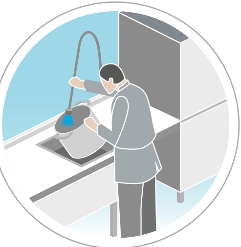
Condensing steam in the dishwasher reduces latent and sensible in dishroom and eliminates the need for a costly vent hood.