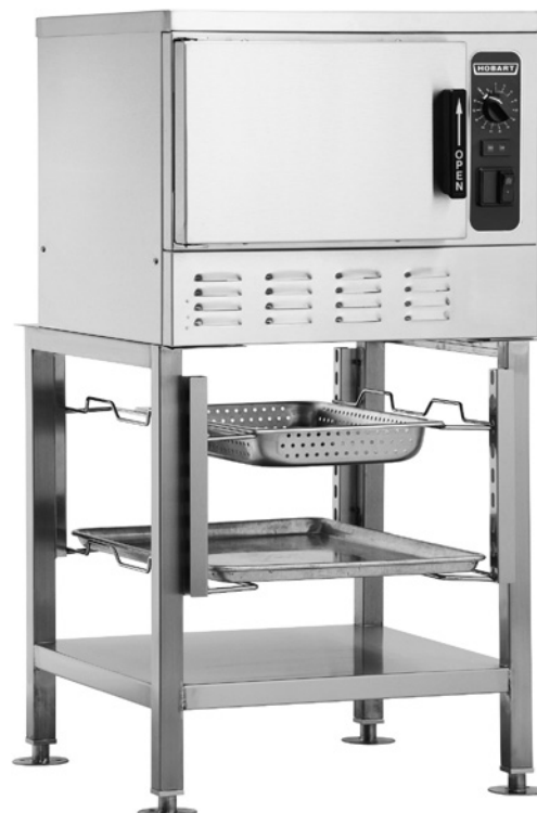
Shown on optional stand with extra set of pan slides and pans