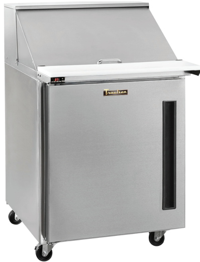
27" WIDE MODELS CLPT-2708-SD-R Hinged Right CLPT-2708-SD-L Hinged Left